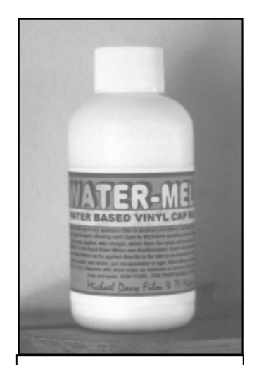
THE ORIGINAL WATER-MELON™ WATER BASED CAP MATERIAL. FDA APPROVED.