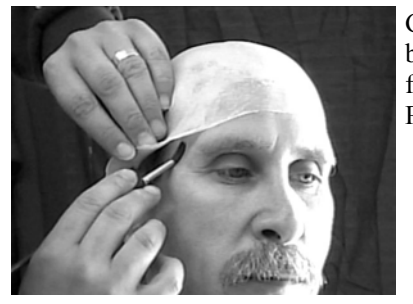
Gently lift the corner of the forehead and slide a brush with alcohol under the cap and apply alcohol from the forehead to the bottom of the sideburn. Pull the cap snug and place it onto the alcohol.