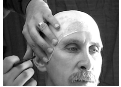
Press the cap into the alcohol and hold until bonded.