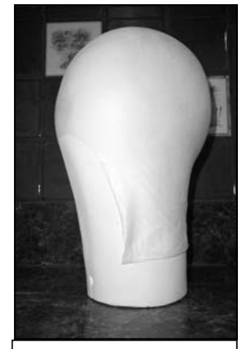
PREMADE WATER-MELON™ ALCOHOL SOLUBLE BALD CAPS. NO ADHESIVE REQUIRED.