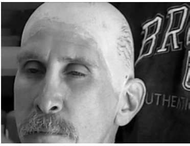
Once the edge is dissolved you are ready to move onto the ear.