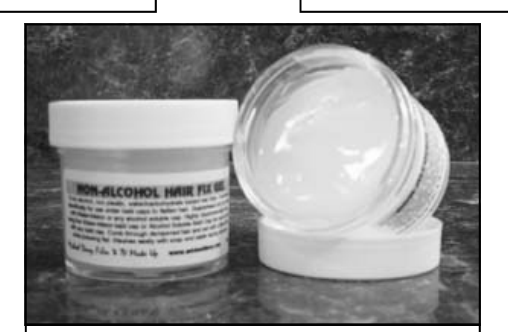
NON ALCOHOL HAIR FIX GEL FORMULATED SPECIFICALLY NOT TO CONFLICT WITH ANY ALCOHOL SOLUBLE BALD CAP. OTHER GELS AND MOUSES MAY CONTAIN FORMS OF ALCOHOL AND ARE TO BE AVOIDED.